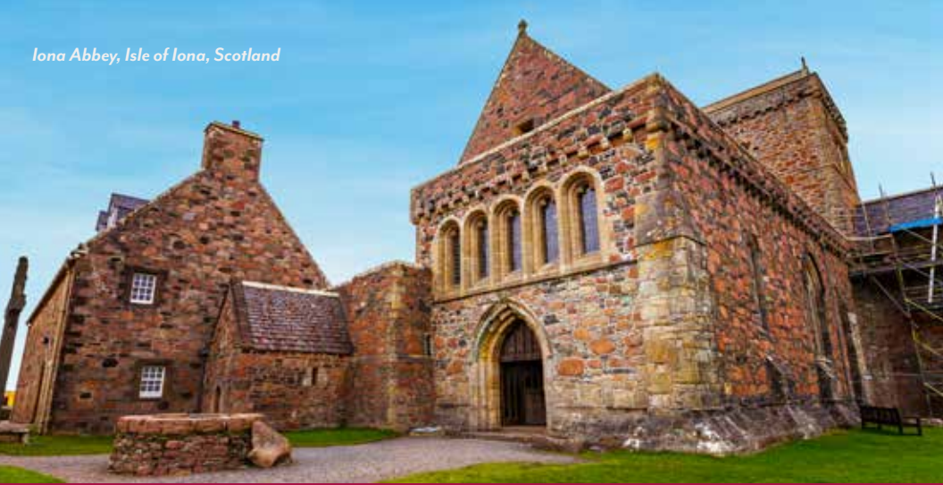
Iona Abbey, Isle of Iona, Scotland

on board and lectures by our guest speakers. (B,L,D)