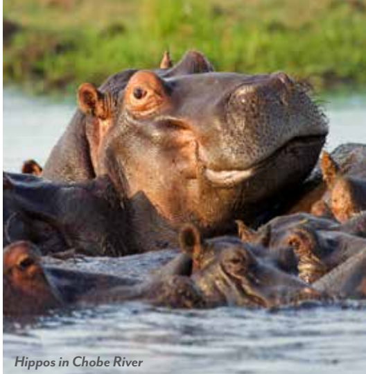
Hippos in Chobe River

Nelson Mandela along Vilakazi Street and visit the house where he lived from 1946 to 1962, a short distance from the former home of fellow Nobel Peace Prize laureate Desmond Tutu. Visit Johannesburg's poignant Apartheid Museum to trace South Africa's 21st-century journey to democracy. (B,L)