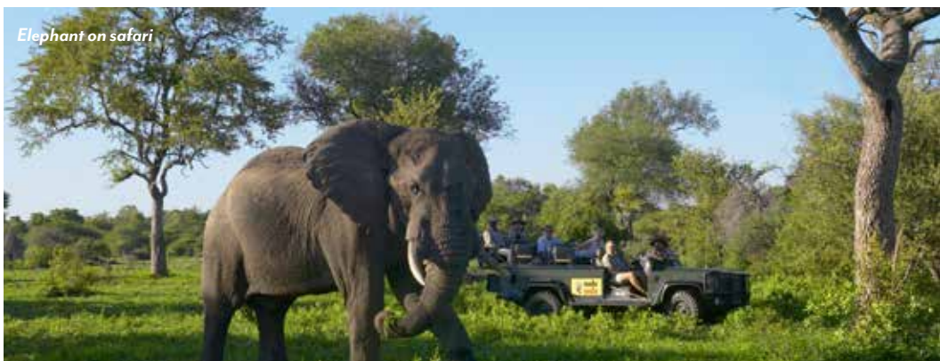
Elephant on safari