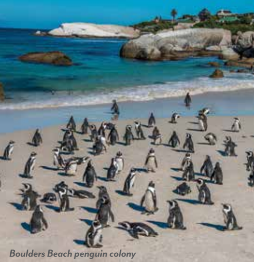
Boulders Beach penguin colony